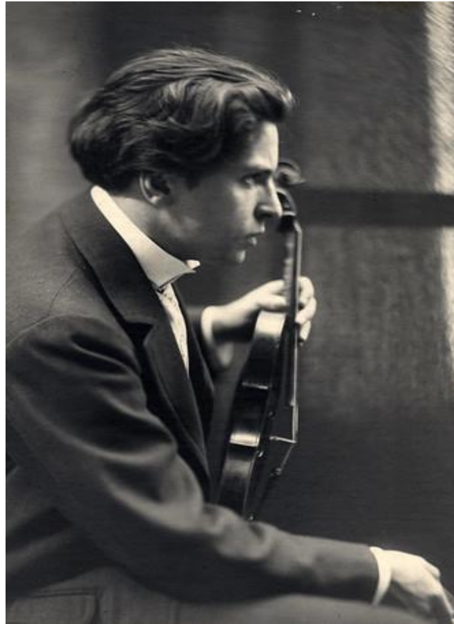
GEORGE ENESCU Born: 19 August 1881 Died: 4 May 1955

He was born in Dorohoi (presently Botosani County).