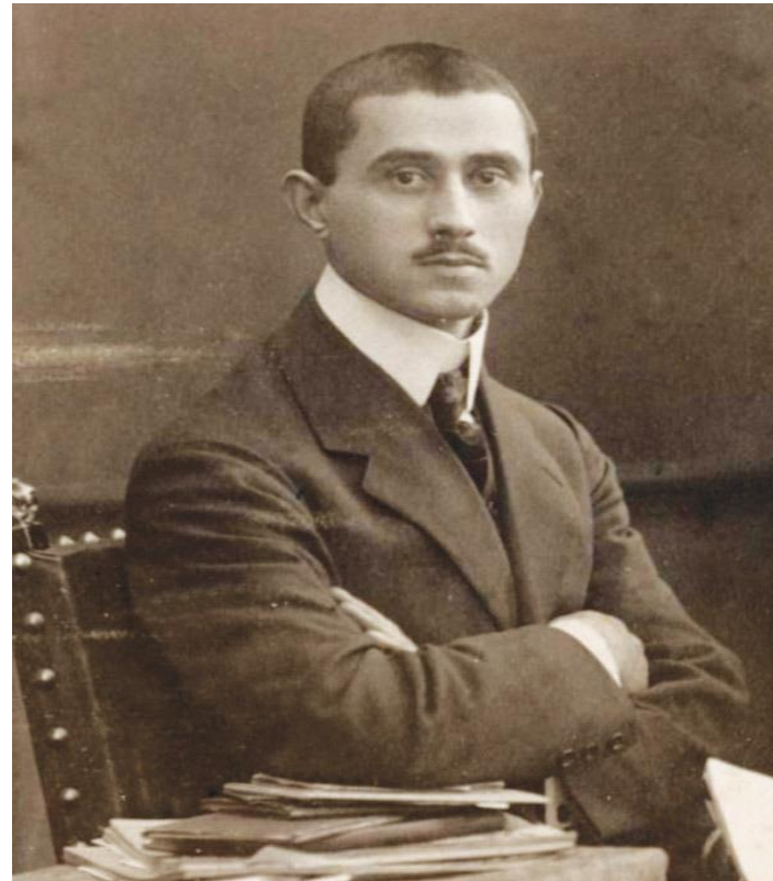
AUREL VLAICU Born in 19 NOVEMBER 1882 Died in 13 September 1913

He began his engineering studies at the Technical University of Budapest, which he continued at the Technische Hochschule in Munich, graduating as an engineer in 1907.